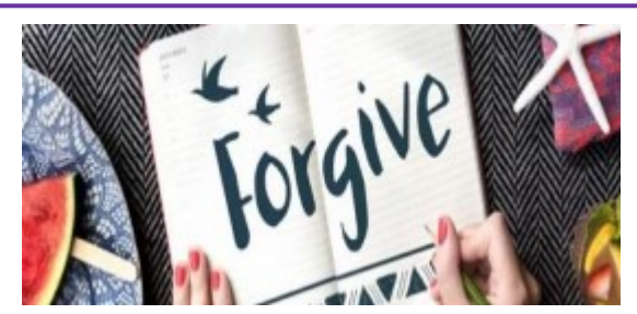
Power of Forgiveness Retreat